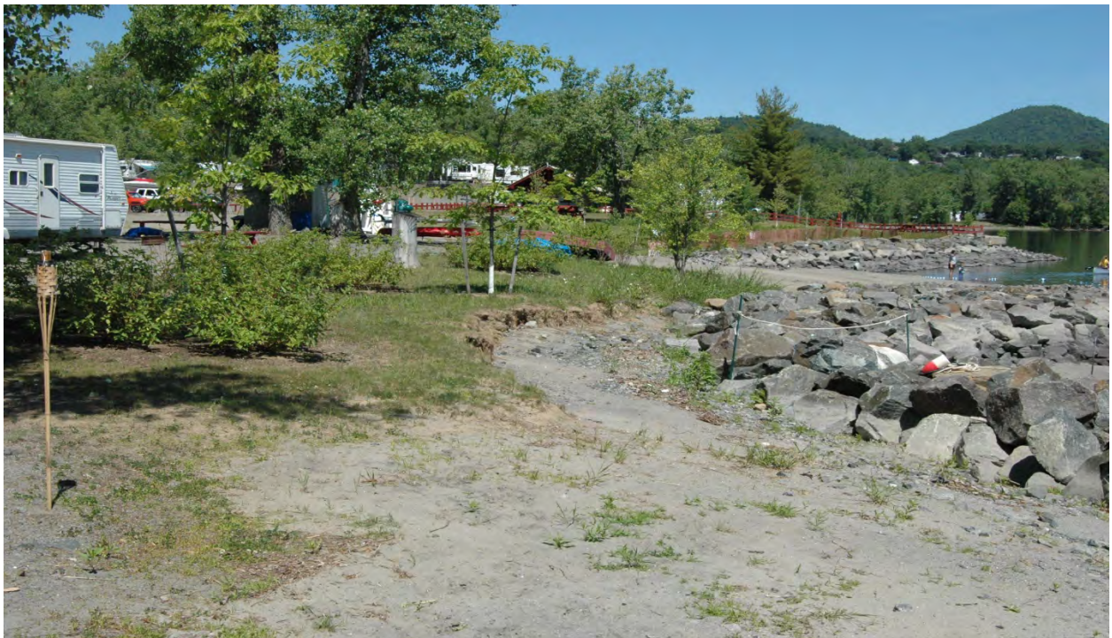
Erosion Occuring Between Rock Revetments