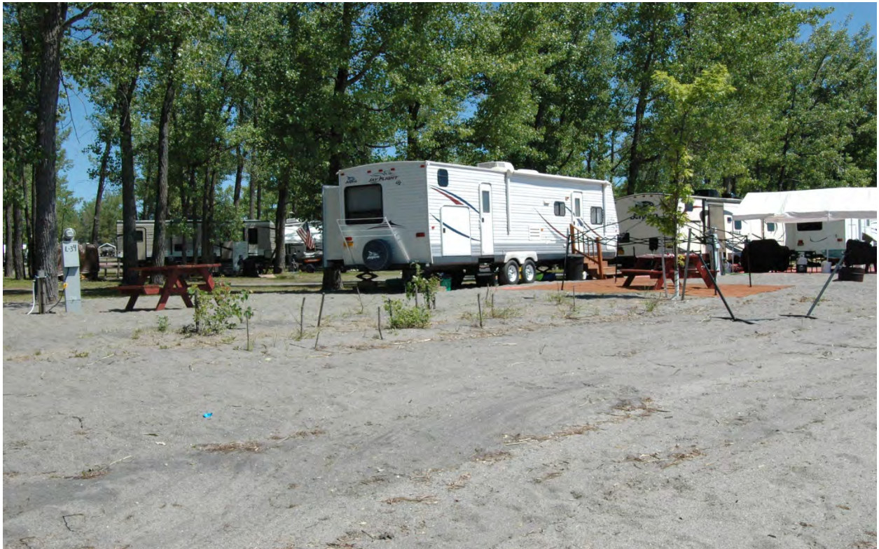
Sediment Deposits Engulfing Planted Berm